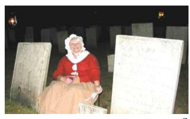
Above photo of East Hartford's Lantern Tour see inside.